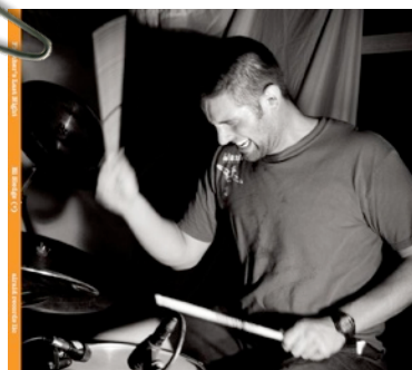
Fletcher's Last Night